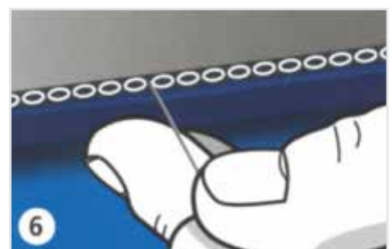
Pass the wire through and cut the excess.