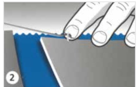
Pop the pin out at 1.5 cm from the edge.