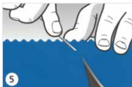
Press the ends back together firmly.