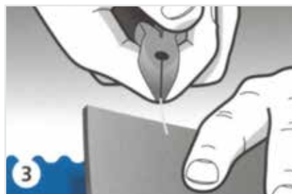
Gently pull the pin out using pliers.