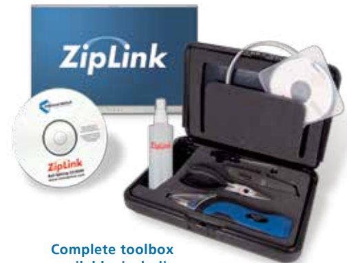
Complete toolbox available, including instruction CD

ZipLink® provides long life and flexibility for multiple applications. The belts can easily and quickly be changed without accruing significant downtime or expensive overtime. After converting to ZipLink®, time and personnel required to change belts may be reduced by more than half.