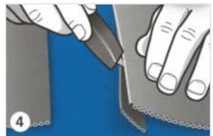
Carefully cut the top cover.